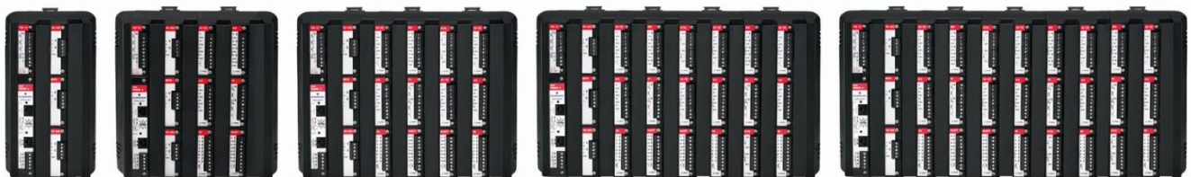
ROC800-Series (with 0, 1, 2, 3, and 4 expansion I/O backplanes)

The ROC800 uses a power input module to convert external input power to the voltage levels required by the ROC800's electronics. Three power input modules are available for the ROC800: 12 volts dc input power, 24 volts dc input power, and 30 volts dc input power.